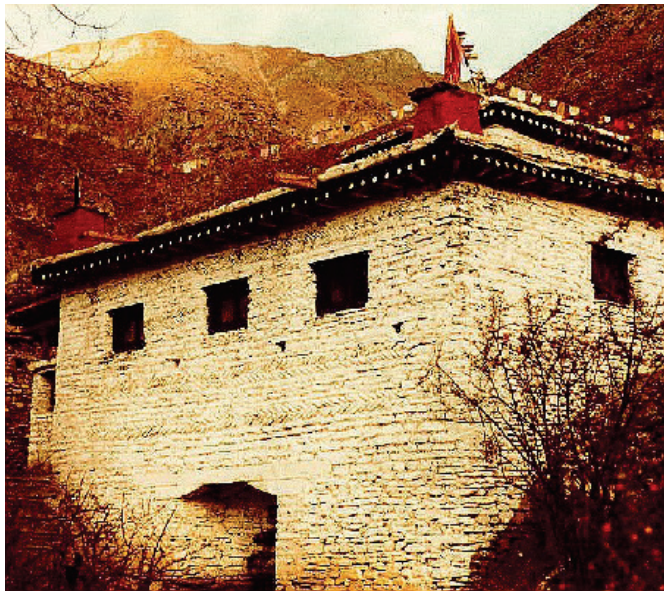
The "Temple Of Miraculous Fire" at Muktinath, Nepal. Photo by Ken Street (Nov. 1979).

[For more on this subject, please read our tract The Temple Of Miraculous Fire .]